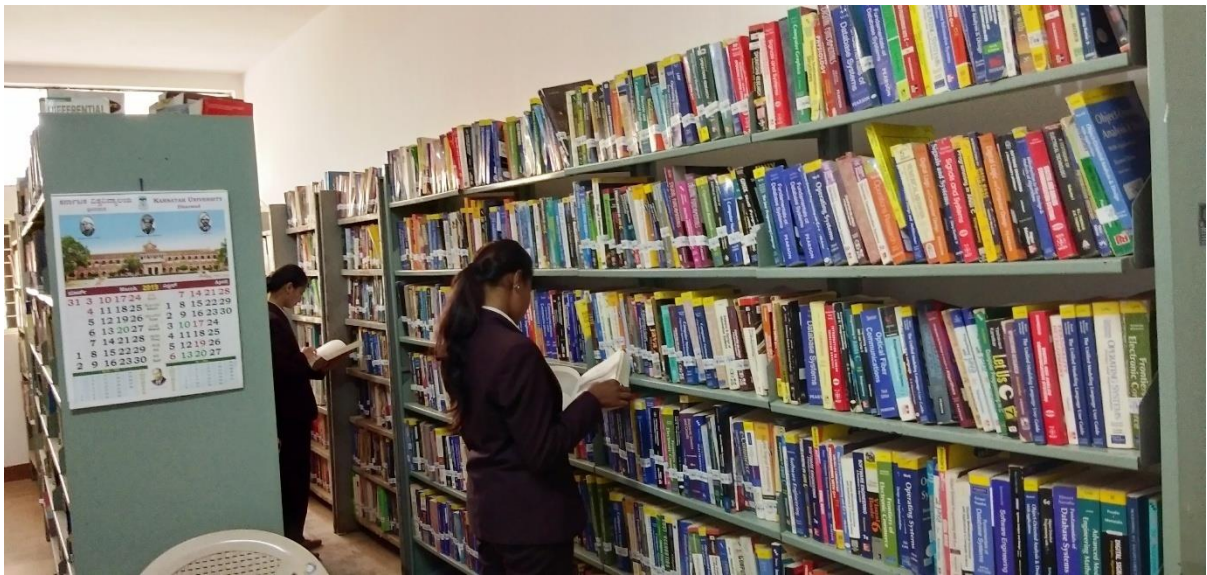
Collection of Books-Home Issue Section