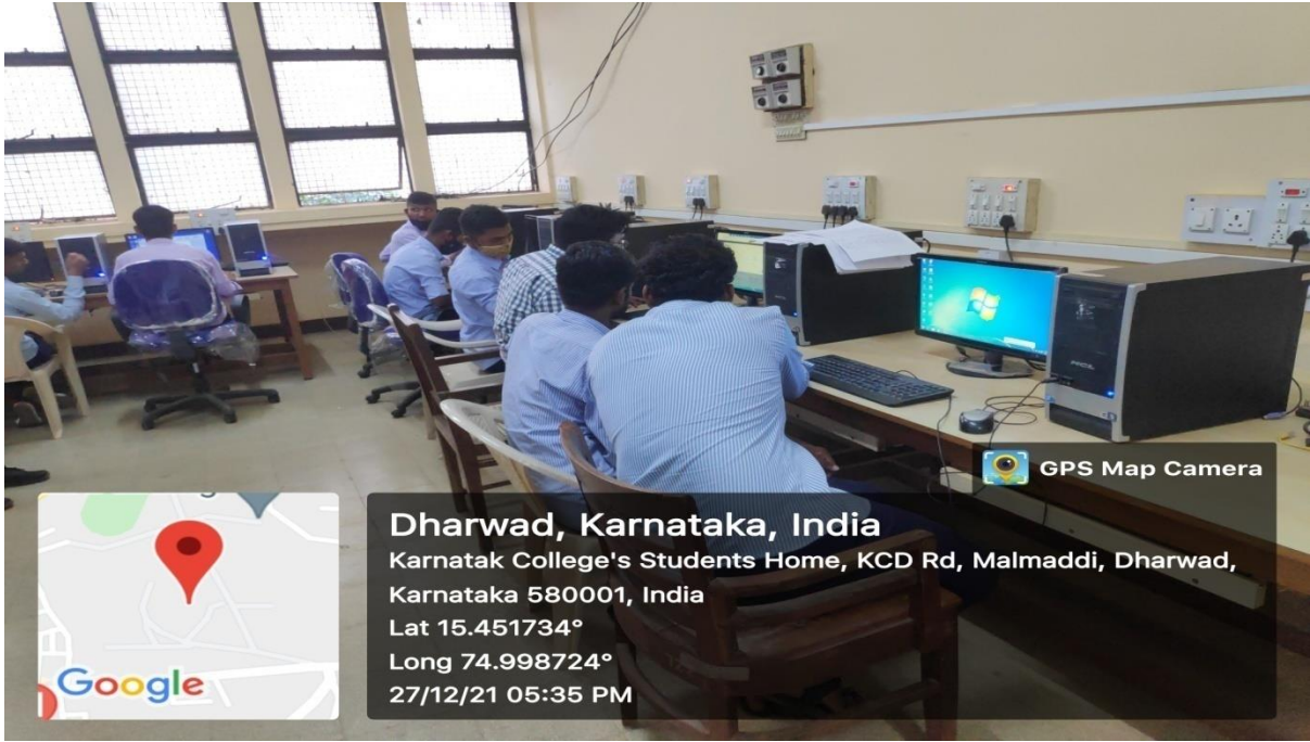
Browsing Centre for Students