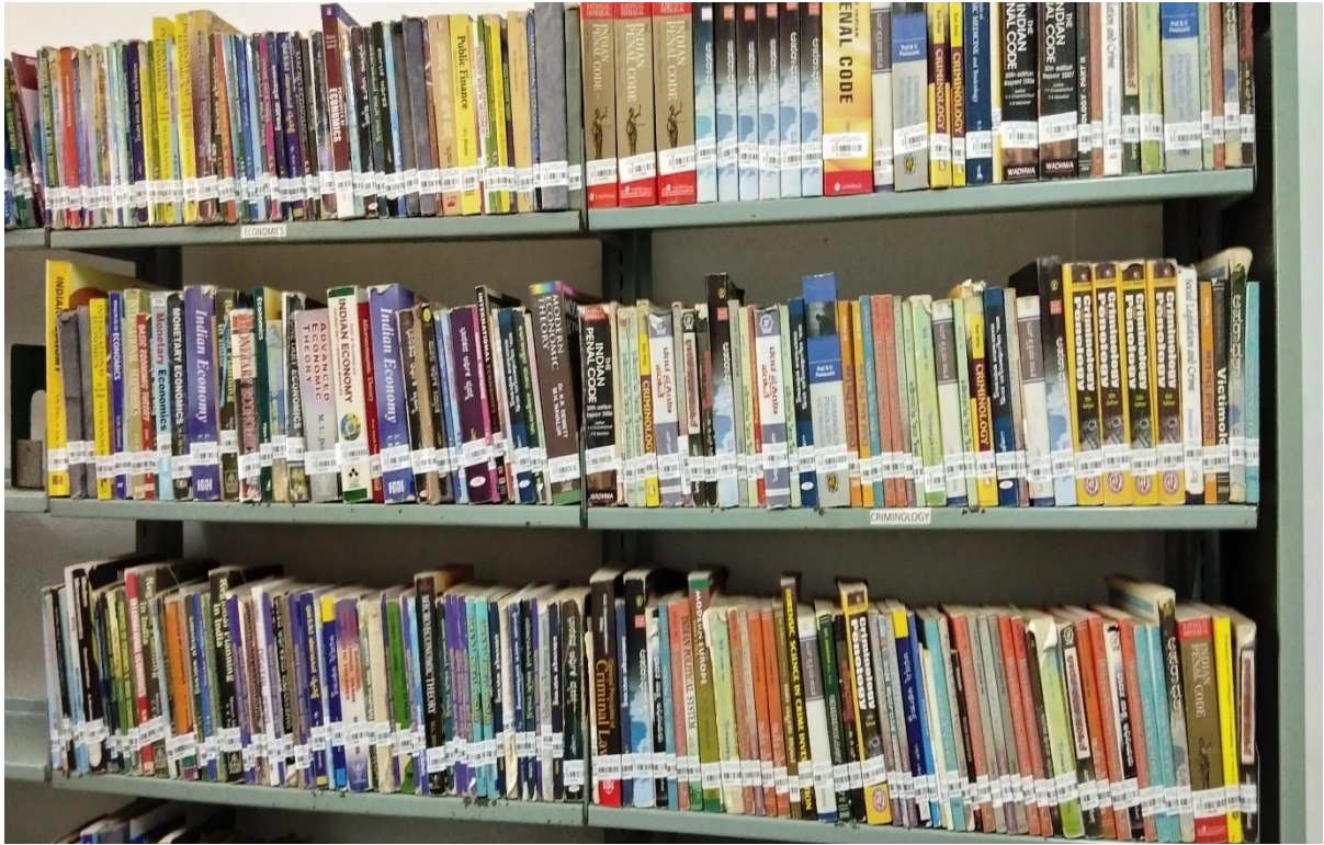
Collection of Books-Reference Section