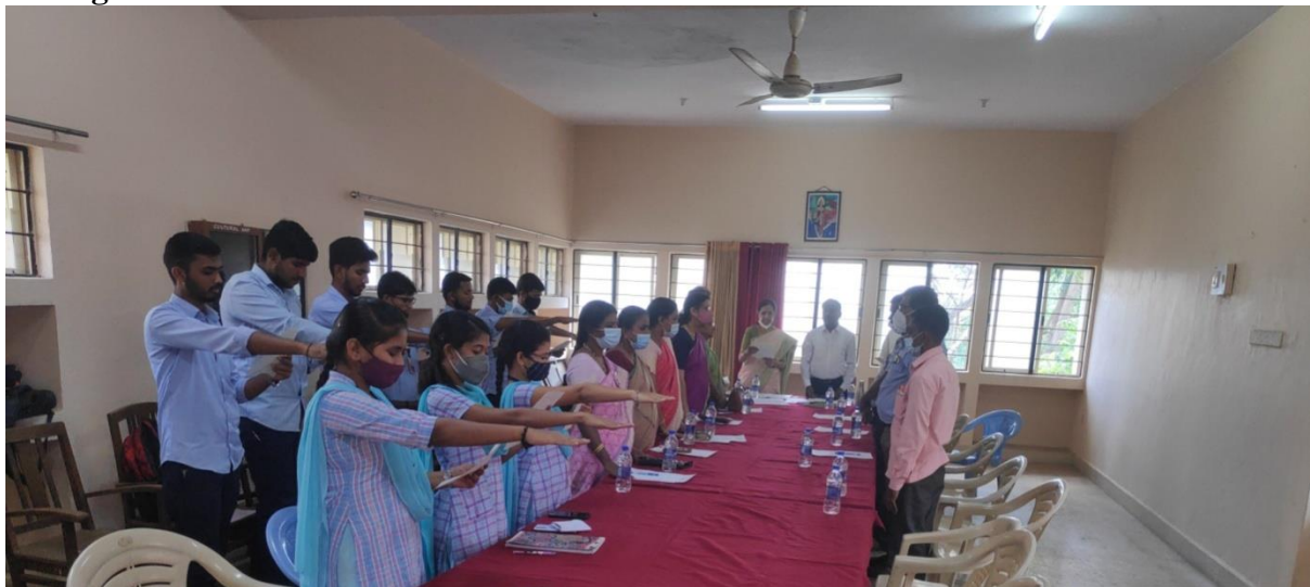
Oath taking ceremony in Karnatak Science College, Gymkhana by student representatives.