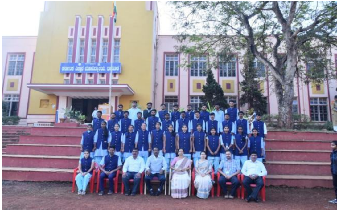
College NSS unit with Principal & Staff members on Republic Day Celebration