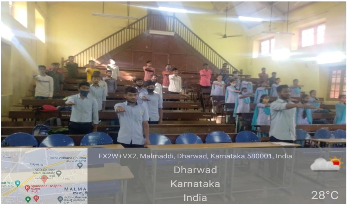
Celebration of Founder's day