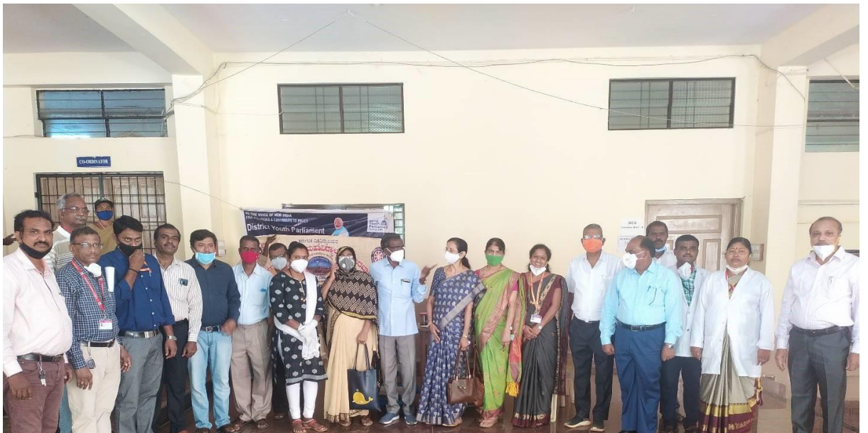
Celebration of District Youth Parliament